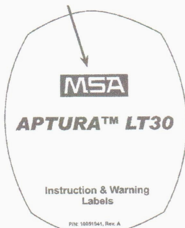
APTURA LT30 SRL Cover Label

If the print on the cover label is green, the unit is not affected by the advisory.